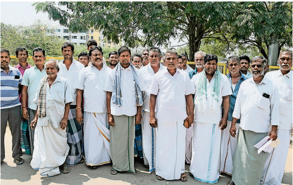
Villagers from Vathalakkarai in Vilathikulam taluk at the Collectorate in Thoothukudi on Monday.