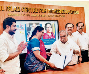
Tessy Thomas takes charge as Vice-Chancellor of NICHE University at Kumarakoil in Kanniyakumari district