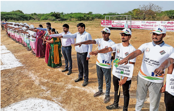
Students of Rani Anna Government College for Women at Pettai in Tirunelveli participate in a voter awareness event on Monday.