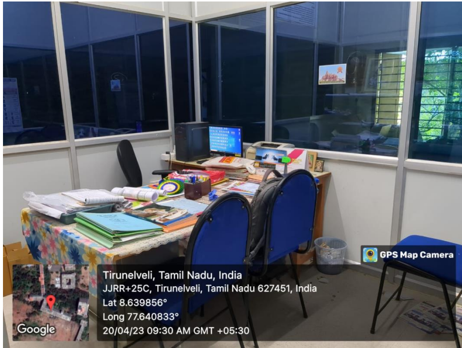
Dust bin in HoD's Office