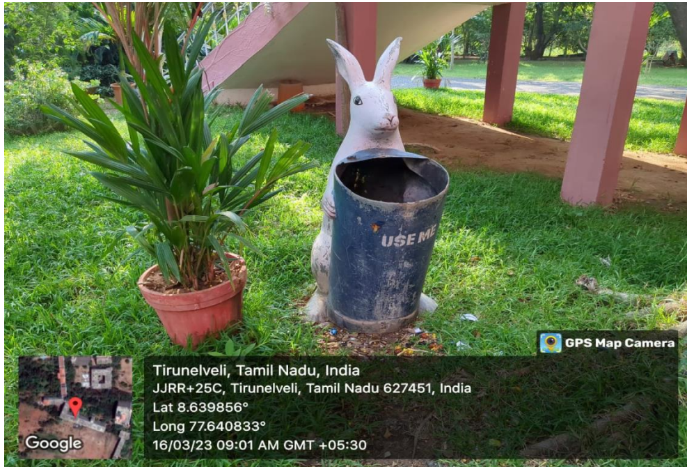
Dust bin nearby Admin Office