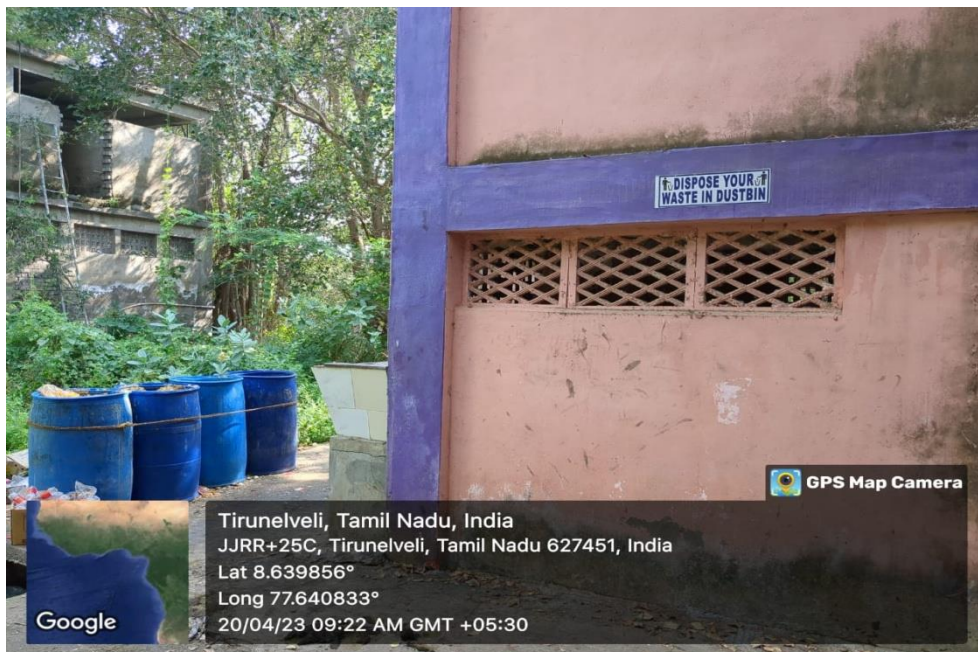
Food Waste Disposal in Hostel